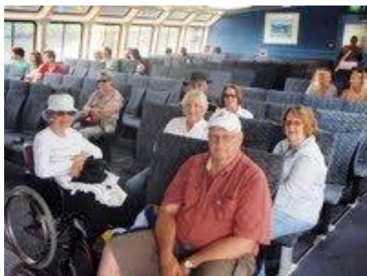
On the Rivercat from Rydalmere

Seven hardy souls attended our first walking group outing in the Sydney Botanical Gardens on Friday 3rd December. By all reports it was a very enjoyable day out.