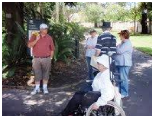
A brief stop during the gardens walk